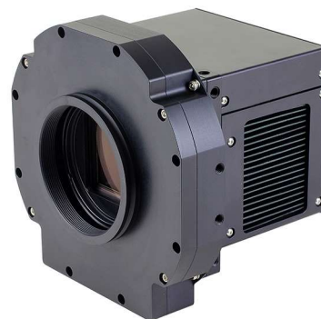
Shown with optional 65mm shutter housing